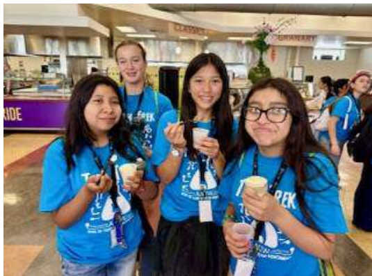
“Whittier campers, enjoying ice cream-sometimes at every meal”.

Morning core classes included anatomy, coding, forensics, and engineering, and afternoons were filled with nature hikes, experiments, games on the lawn and small group projects where the girls were asked to collaborate on solutions to a pressing problem in our world, and to present their ideas to the entire group. It was really gratifying to watch them grow, gain confidence, and have fun with new friends! Lots of smiles, all around.