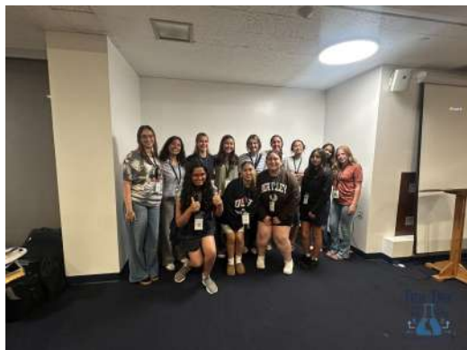
Santa Barbara Tech Trek Campers