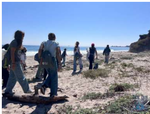
Santa Barbara campers enjoying the beach.