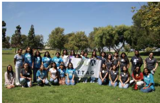
Twenty-eight TTAG members enjoying the annual picnic on August 3

The newer members benefited by hearing advice from the older girls about keeping up their grades while balancing other activities. Everyone enjoyed pizza and a bounty of goodies brought by attendees and their families. We look forward to our annual holiday get together in December.