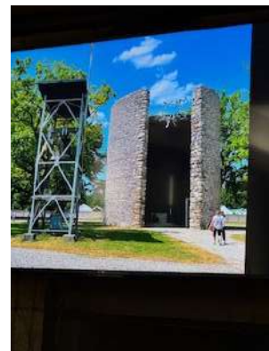
Museum of Tolerance