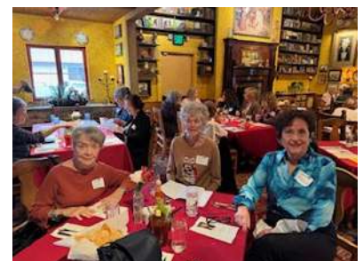
PVP AAUW members enjoying the day