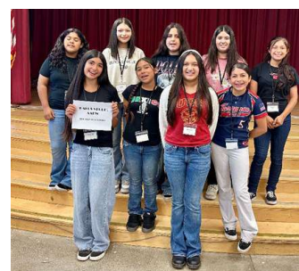
AAUW CA PVP 2024-2025 Campers