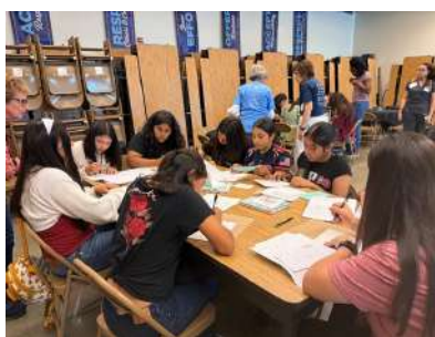
Campers already at work!