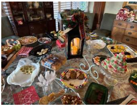
A sumptuous offering of holiday goodies