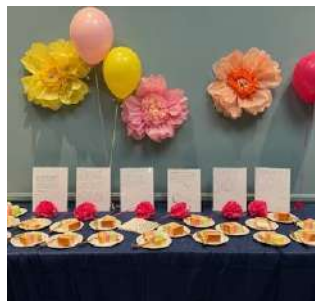
Dessert table with letters from campers displayed