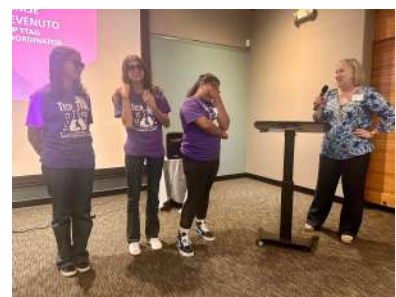
“Their future looks bright”