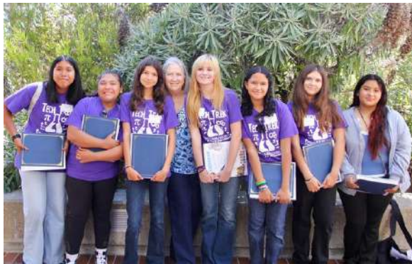
2024 Tech Trek Campers

The success of this program, which is primarily funded from AAUW member donations, was certainly evident from the enthusiasm and appreciation these girls expressed. Thank you to the committee for contributing to the success of Tech Trek. It was a proud moment for AAUW PVP.