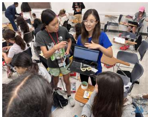
A 2025 PVP Camper learning Robotics