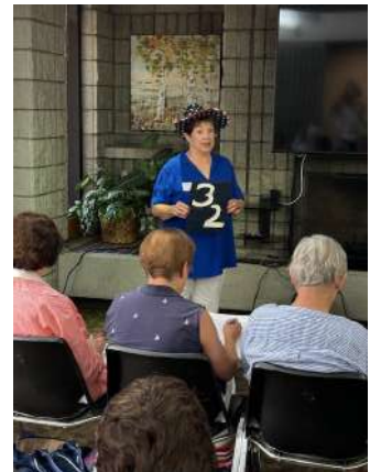
Members assisted explaining state propositions