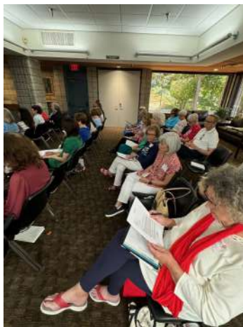
An attentive gathering enjoying the presentation