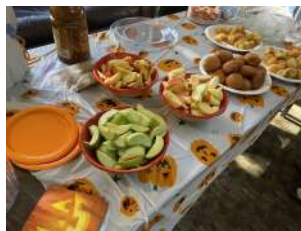
The Winners Cider-Shera's recipe with red hots Donuts-Randy's Apples-Sweet Tango