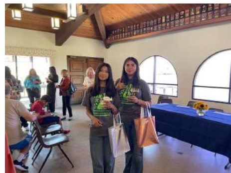
Campers received gift bags