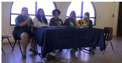
Students share camp experience