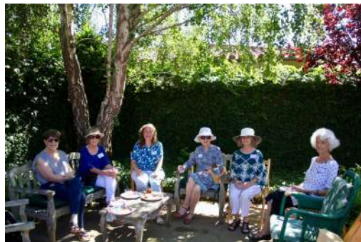
Members and guests getting acquainted