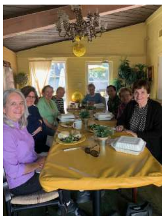
Spring Luncheon, 4th Monday Book Group