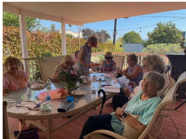
The Women Helping Women Group met in September for a postcarding session. The group has written and sent several hundred postcards to women throughout the United States encouraging them to vote in the upcoming elections!"