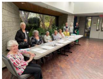
2022 Tech Trek Committee