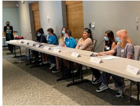
Tech Trek Class 2022