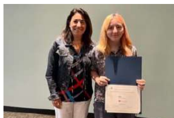
2022 Tech Trek Campers receiving certificates