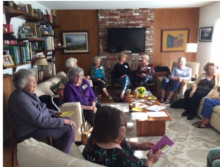
PVP AAUW women enjoying the day