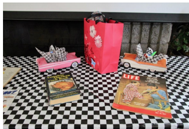
Artifacts of the era