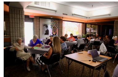
Members enjoying the day