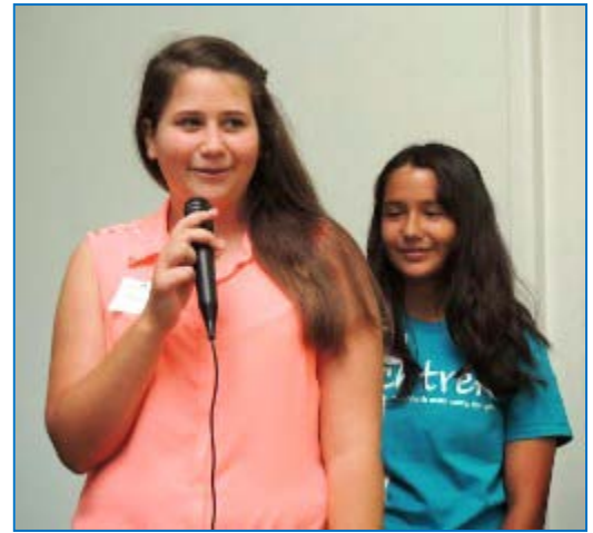
Above Left and Right: Campers eagerly line up to answer questions and talk about their favorite foods, events and experiences while at Tech Trek, what they learned, how it was living in a college dorm and how they think the Tech Trek week has changed them