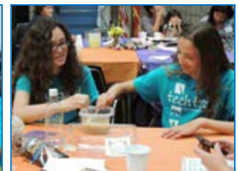
Everyone enjoyed the science experiment – using magnets to extract iron from fortified breakfast cereal