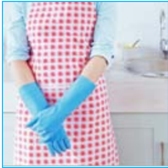
Get Rid of the Gloves