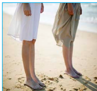
Shake off the Sand