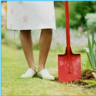
Scuttle the Shovel

Now that we women have the vote, let's use it well !!