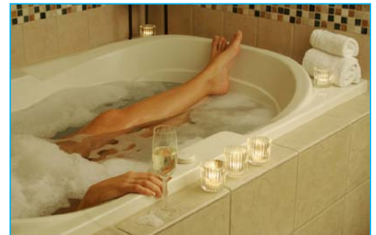
Get Yourself Relaxed and Refreshed and Come to the Meeting