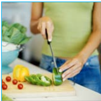
Cancel the Chopping