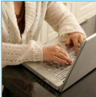
Lose the Laptop