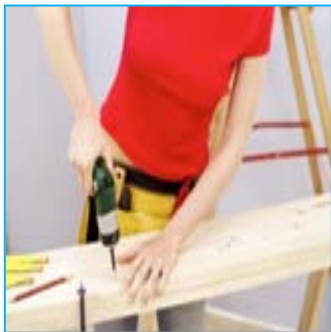
Put down the Project