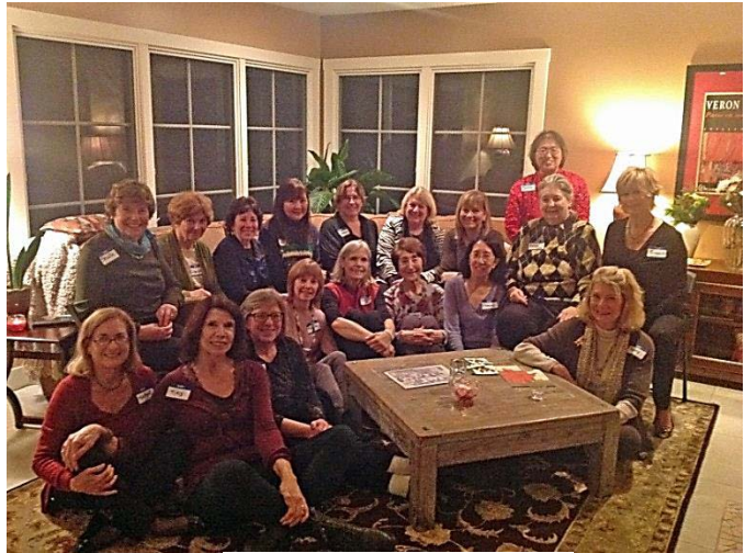
Last WIT meeting